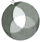
EXHIBIT C – CODE OF ETHICS AFFIDAVIT