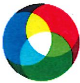
EXHIBIT C – CODE OF ETHICS AFFIDAVIT